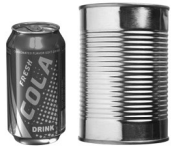
CANS Aluminum & Steel