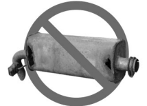
NO Scrap Metal