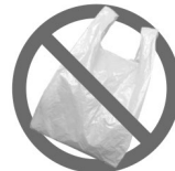
NO Plastic Bags