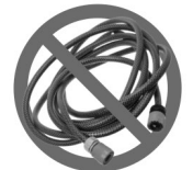
NO Garden Hoses