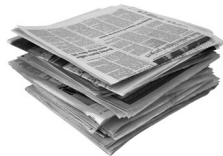
NEWSPAPER Clean & Dry