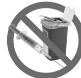
NO Medical Waste