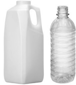
PLASTIC Bottles & Jugs, 1, 2 & 5